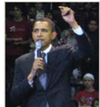
Barack Obama speaks at Comcast Center on Feb. 11.

Obama won the hard-fought Democratic nomination en route to a General Election victory over Sen. John McCain, the 2001 winner of the Center for American Politics and Citizenship's Millard E. Tydings Award for Courage and Leadership in American Politics.