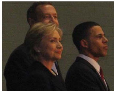
Hillary Clinton, Martin O'Malley, and Anthony Brown at Bowie State University on Feb. 9.

he had to say. Throughout the 45 minute, joke-filled speech, Huckabee discussed wide-ranging issues from the elimination of the IRS to making college more affordable. Commenting on the fact that it was nearly mathematically impossible for him to win the Republican nomination, he said, "I didn't major in math; I majored in miracles." Though the miracle did not come, he fought hard.