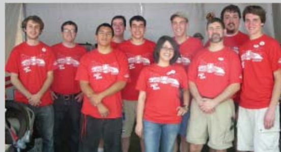
CAPC faculty and staff help celebrate Maryland Day 2008.

Besides eating their fair share of the more than 50,000 cupcakes baked especially for the event, the Center for American Politics and Citizenship was able to register voters and election judges, and introduced voters to the latest research on voting technology.