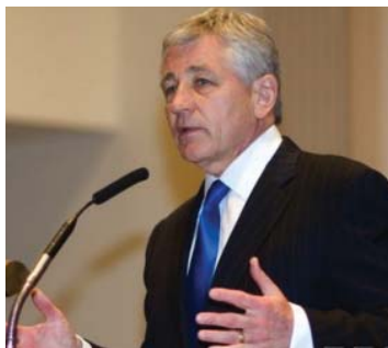
Sen. Chuck Hagel (R-NE)

One of only two Senate Republicans who voted in favor of a troop withdrawal, Hagel touched on pertinent issues, such as his controversial decision to break from the Republican ranks